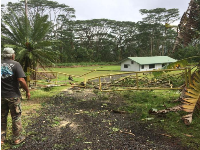
Assessing damage from the storm