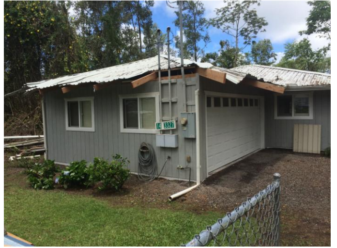
Tree fell and damaged a LA member's home in Nanawale