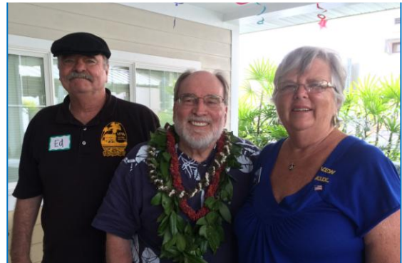
Meeting with Gov. Abercrombie to discuss Veterans Issues