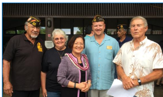
Meeting with Sen. Mazie Hirono to discuss Veterans Issues