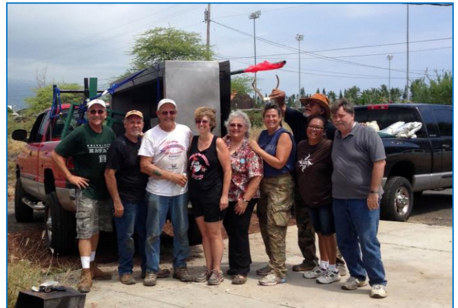
Received donation of kitchen range hood from VFW Post 12122 in Kona