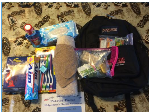
Filled and Donated Patriots Back Packs for Needy Veterans