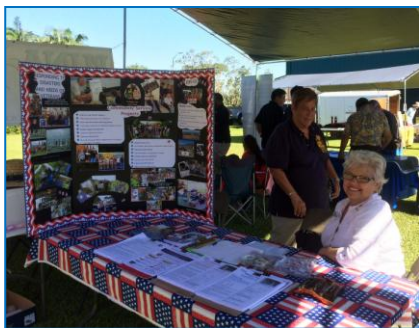
VFW Booth at Community Preparedness Fair