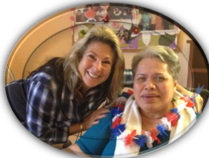
Visiting Veteran's Spouse at Hale Anuenue