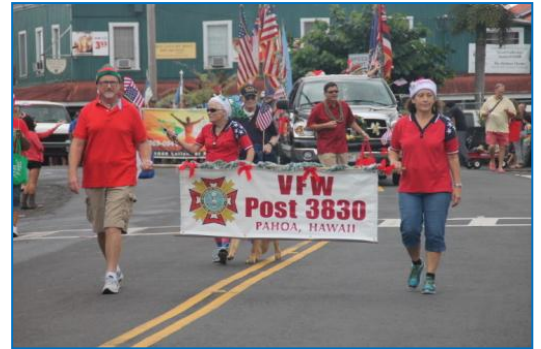
Pahoa Holiday Parade