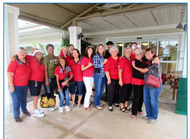
Spreading Christmas Cheer to the Veterans at Yukio Okutsu Veterans Home