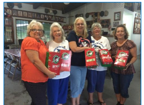
Filled Christmas Shoeboxes for Needy Children