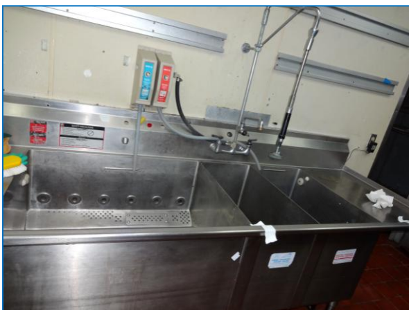
Received donation of kitchen equipment from Burger King in Kona. Now all we need is a kitchen.