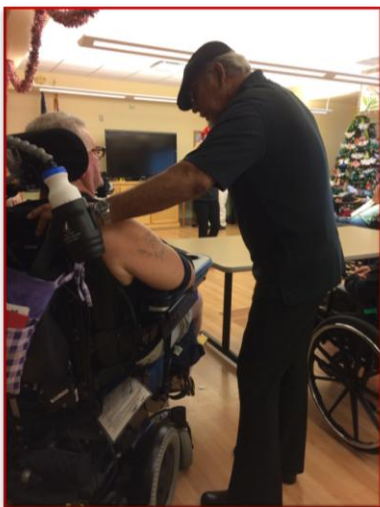
Visiting USMC Veteran at Yukio Okutsu Veterans Home

Feb. 1 - Community Breakfast Feb. 7 - Chili Dinner and Bingo Feb. 15 - Community Breakfast Feb. 21 - Community Dinner