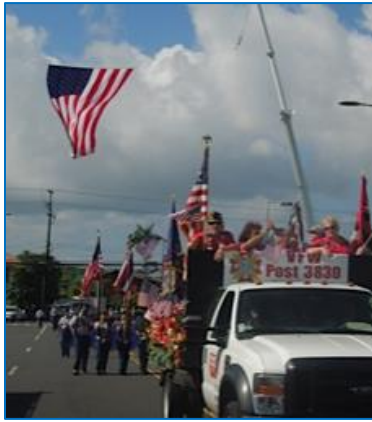
Veterans Day Parade in Hilo