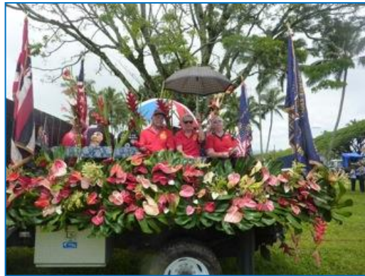
Post 3830's entry in the Merrie Monarch Parade