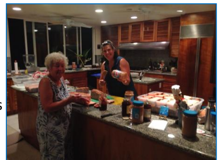
Making PBJ sandwiches to feed the troops at PTA