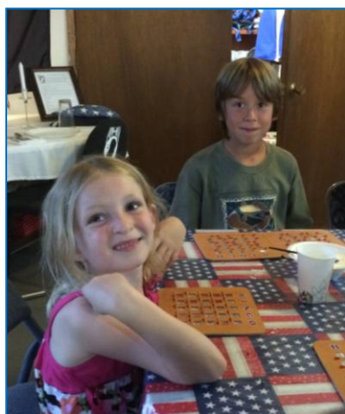
Chili & Bingo Nights Enjoyed by All Ages