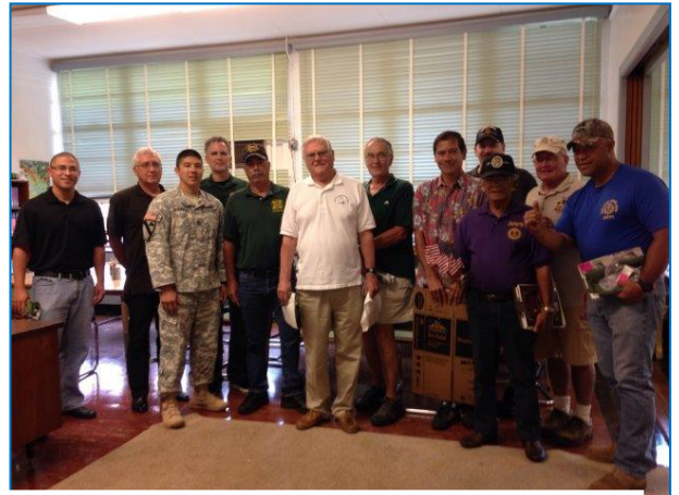
Take a Veteran to School Day at St. Joseph Elementary School