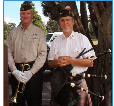
We honored departed Veterans on Memorial Day at Puna Hongwanji Mission, Veterans Cemetery #1, the Vietnam Memorial, and KMC