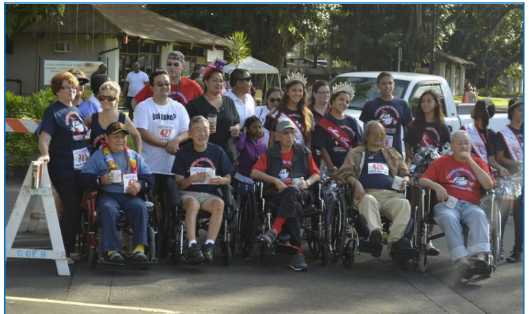
Veterans from Yukio Okutsu Veterans Home participated in "A Salute to Our Veterans" 5K Run/Walk on July 4 at Liliuokalani Gardens